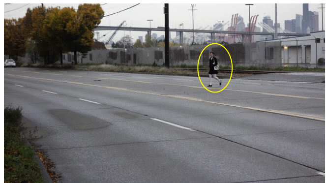
Warning signs and flashing beacons or signal are needed to call attention to pedestrians crossing.