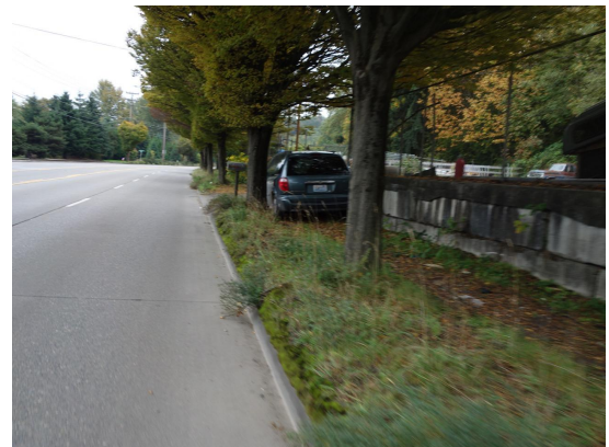
The unpaved path on west side of West Marginal gets muddy, overgrown and blocked by vehicles..