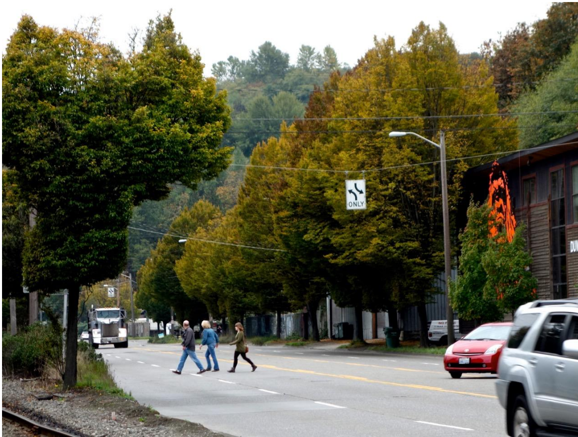
People crossing from Longhouse to park, trail and car parking. 40 mph posted speed limit. Four traffic lanes and a center turn lane. No warning to drivers.