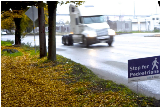
Lots of heavy truck traffic.