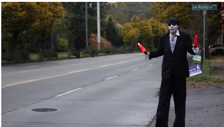
Volunteer crossing guard for community Halloween Party. Scary traffic!