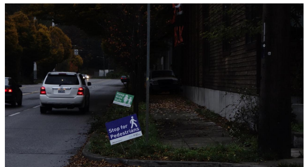
Many events end after dark. It is difficult for drivers to see pedestrians crossing without a marked crosswalk and signal or flashing beacons.