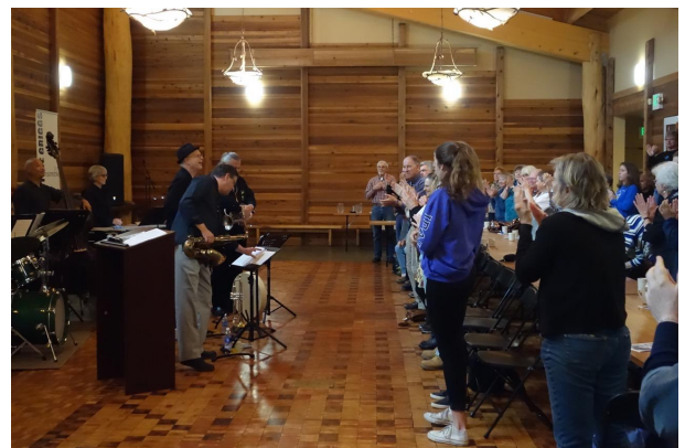
The Duwamish Tribe welcomes the entire community to a wide variety of programs and events..