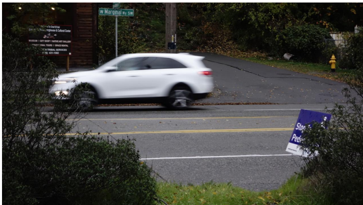
Pedestrians cross here at SW Alaska St from Longhouse to parking at Herring's House Park.