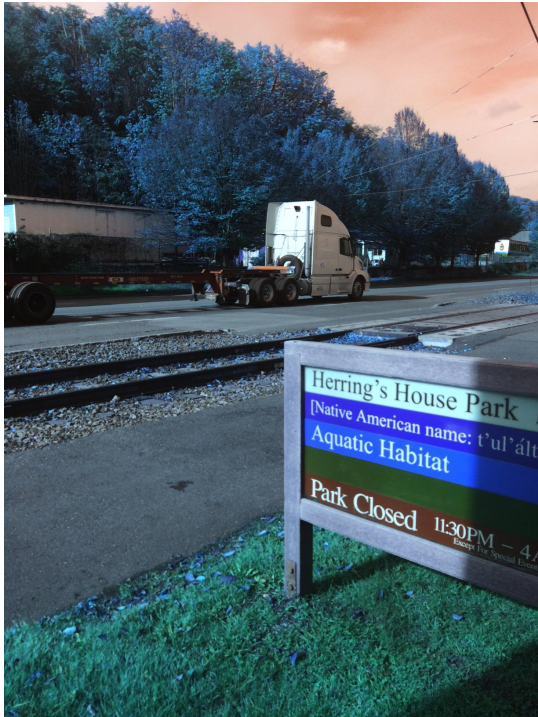
Visitors park at Herring's House and T-107 Parks across from the Longhouse.