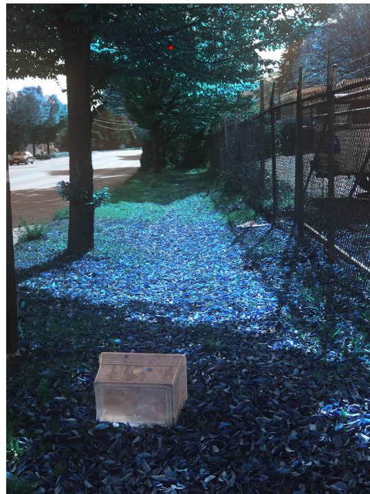
An ADA accessible sidewalk is needed on the west side of West Marginal for access to the Duwamish Trail Route and parking lots.