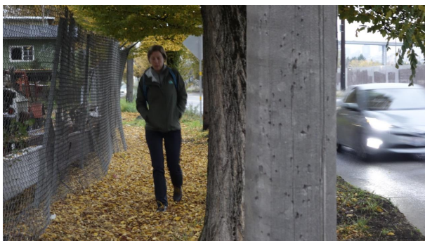
There is only a dirt path on the west side of West Marginal from SW Alaska to SW Idaho. Not ADA accessible, or safe for anyone.